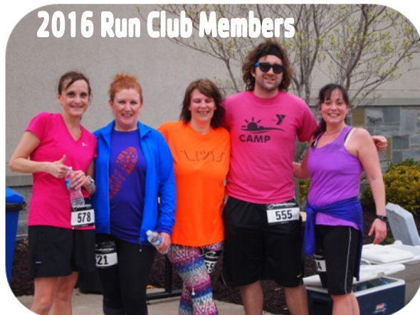
2016 Run Club Members